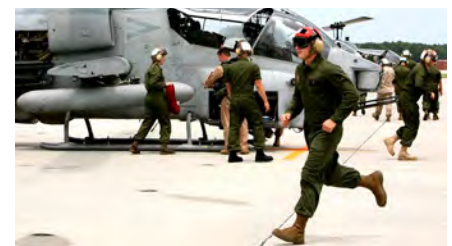
MCAS Cherry Point provides training on the SuperCobra attack helicopter (bottom) and bombing runs on nearby Piney Island (top).